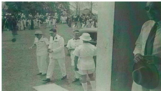
Picture 5: French administrators in two varieties of command outfits during a colonial party in Tibati before 1960