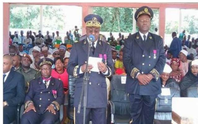
Picture 7: The governor's outfit during the technical handover to Ngaoundéré Senior-Divisional officer

Source: Picture taken by Madina on 07-22-2017 in Ngaoundéré