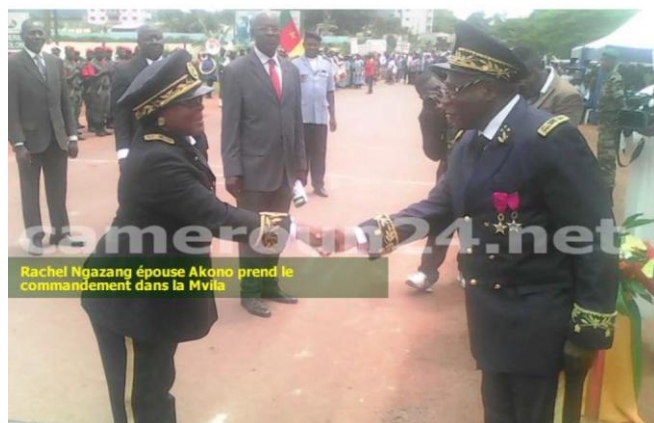
Picture 6: Taking command in the Baré Bakem Sub-Division in the department of Moundou