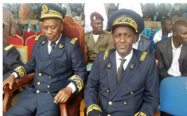
Picture 10: Uniforms of Divisional-Officers during a technical ceremony