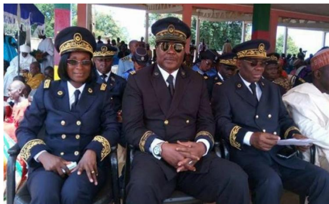
Picture 9: Recognition of Senior-Divisional officer through the badge on their cap

Source: Picture taken by Madina on 07-22-2017 in Ngaoundéré